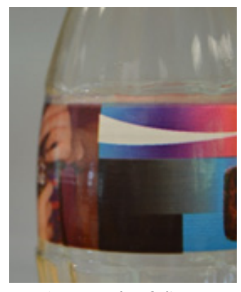
An example of direct container print on a non flat surface

digitally directly to the packaging eliminates the need for additional substrates and can be retrofitted to existing lines. Latest developments allowed non-flat surfaces to be printed with robust ink in spectrums of colour. The technology allows for significant (using the pack print artwork can highlight key features of the product or packaging) with variability to the artwork creating differentiation on shelf.