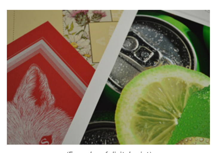
(Examples of digital print) Here are some great examples of what is now achievable from digital print. The sample on the top shows how white inks can be printed onto coloured substrate. Sample to the left shows silver inks printed on to a coloured substrate, moving away from foils. Sample to the right shows clear inks printed onto

conclude, carefully consider the appropriate technology to implement through personalisation late stage customisation. iDi Pac Ltd is an expert packaging and supply chain consultancy who understands late stage customisation techniques. We support brands to expand their businesses with ease, through experience understanding the process of implementation. Talk to us to find out more about late stage customisation and how it can develop your business.