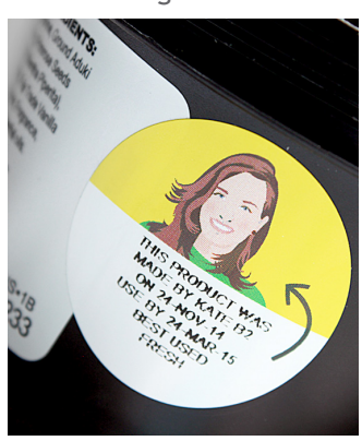
Lush's labels used to personalise and express the handmade nature of the product

in late stage customisation (LSC) technologies fundamental. To maximise benefits from this method of consumer engagement, we must firstly understand expected outputs batch sizes for a given SKU (stock keeping unit) which in turn identifies an appropriate technology for personalisation. There is a wide range of tailored solutions available small to large brands!